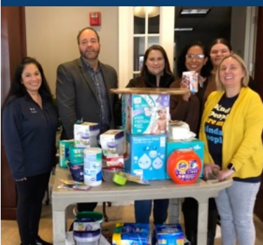
THANK YOU TO WATTERSON FOR THEIR DONATION!