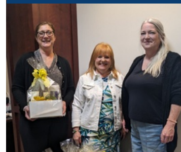
THANK YOU FOR YOUR MOTHER'S DAY GIFTS TO CLIENTS, MARY KAY!