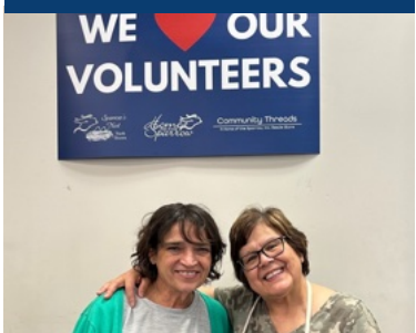
HOS HANGS NEW BANNERS IN APPRECIATION FOR VOLUNTEERS