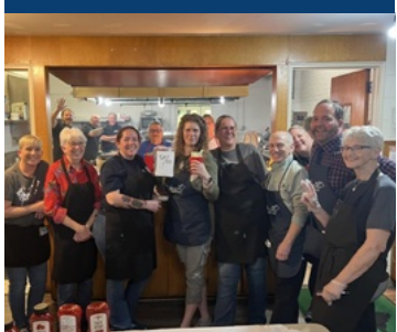
THANK YOU, WOODSTOCK MOOSE LODGE 1329