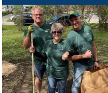
THANK YOU APTAR FOR VOLUNTEERING AT AN HOS PROPERTY!