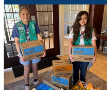
THANK YOU TO GIRL SCOUTS OF NORTHERN IL FOR THEIR COOKIE DONATION TO OUR SHELTER!