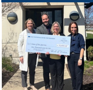
HOS RECEIVES $10,000 FROM OLD NATIONAL BANK!