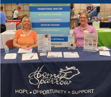
HOS AT THE ARLINGTON HEIGHTS LIBRARY VOLUNTEER FAIR