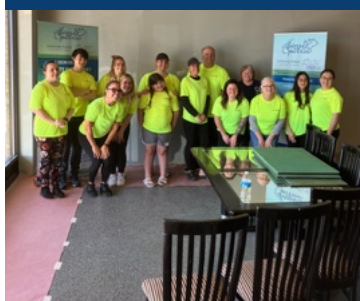
THANK YOU, ORTHO ILLINOIS FOR VOLUNTEERING AT OUR MCHENRY NEST!