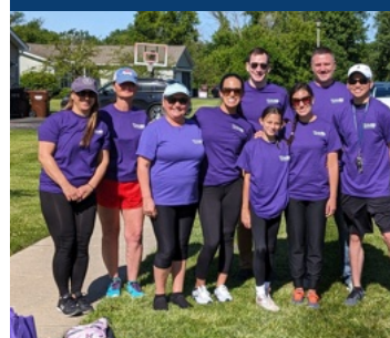
THANK YOU, NORTHWESTERN MEDICINE!