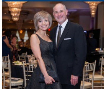
THANK YOU FOR ATTENDING HOS' 2024 BLACK AND WHITE BALL