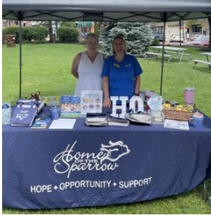
HOS AT PLANET PALOOZA ON THE WOODSTOCK SQUARE