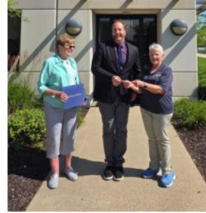
THANK YOU TO THE CARY CHAMBER OF COMMERCE!