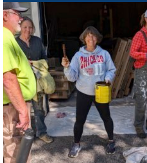
THANK YOU FOR VOLUNTEERING PEACE LUTHERAN CHURCH!