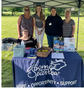
HOS AT THE OPTIONS AND ADVOCACY COMMUNITY PICNIC