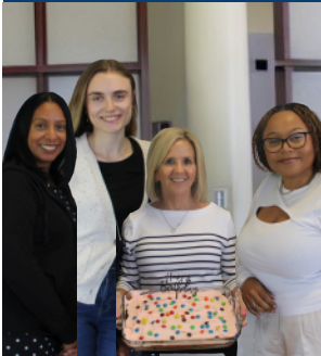
AUGUST STAFF BIRTHDAY CELEBRATIONS