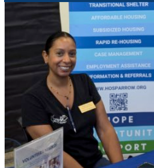
HOS @ THE STEVENSON HIGH SCHOOL KEY CLUB FAIR