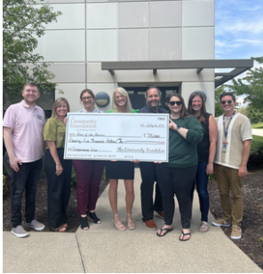
THANK YOU TO THE COMMUNITY FOUNDATION!